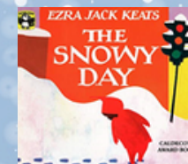
The Snowy Day by Ezra Jack Keats