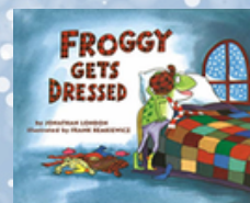
Froggy Gets Dressed by Jonathan London