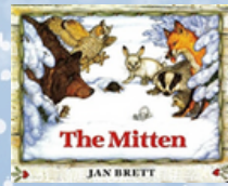
The Mitten by Jan Brett