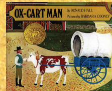
Ox-Cart Man by Donald Hall