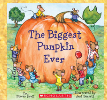
The Biggest Pumpkin Ever by Steven Kroll