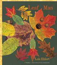
Leaf Man by Lois Elhert